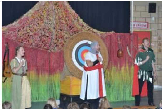
Visit from Wizard Theatre Company