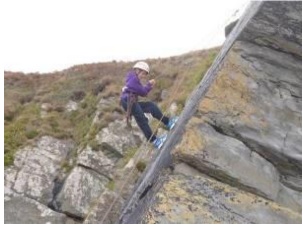
Year 6 children having fun at Arthog