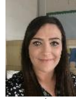
Miss Hailey Base 6