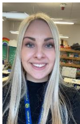
Miss Hill Base 1