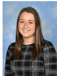
Miss Buckingham Base 2