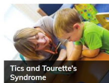
Tics and Tourette's Syndrome