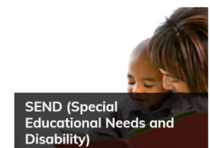
SEND (Special Educational Needs and Disability)