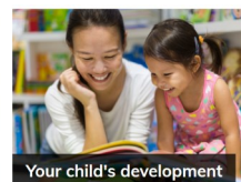
Your child's development