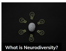
What is Neurodiversity?