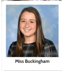
Miss Buckingham Base 5